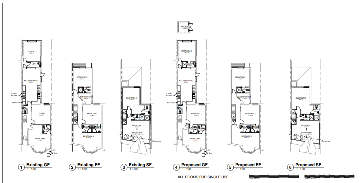
Figure 1: Existing and proposed floor plans